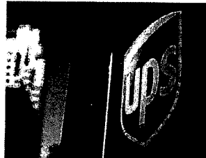
A United Parcel Service truck on delivery is pictured in downtown Los Angeles, Calif., on Oct. 28.

ATLANTA — United Parcel Service Inc.'s chief executive officer said on Monday the company's closer collaboration with major retailers should bring a smooth holiday season, but he said UPS would charge customers more or even refuse packages if last-minute sales by a major customer threaten the company's system.